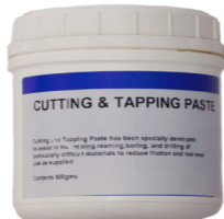
Cutting & Tapping Paste 500g Part No. CHEM0181