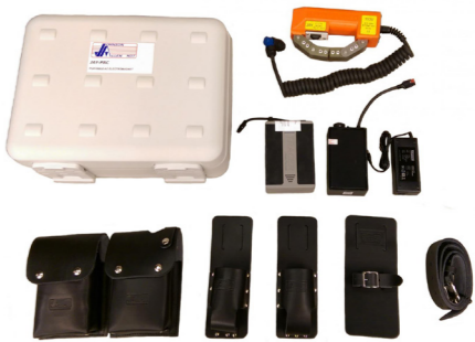
JAY-PAC Yoke Battery Pack 110V Part No. CHEM0214