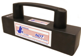
Calibrated NDT 4.5 Kg Test Weight Part No. CHEM0217