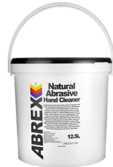
Hand Cleaner Paste Plus Pumice 12.5 LTR (9445) Part No. CHEM0249 5 LTR - CHEM0248