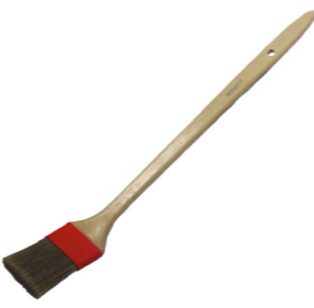
Pickling Paste Angled Brush 2" Part No. CHEM0031