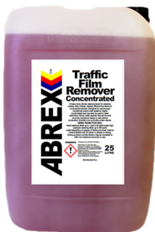
Traffic Film Remover Concentrate 150 25 LTR (6995) Part No. CHEM0243 5 LTR - CHEM0242