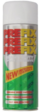
Heavy Duty Adhesive Spray 500ml Part No. CHEM00035