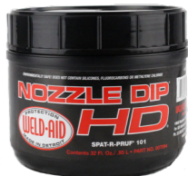
Weld Aid HD Nozzle Tip Gel 32 oz Part No. CHEM0171