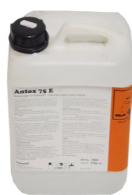
ANTOX 75E Liquid - 5 Kg