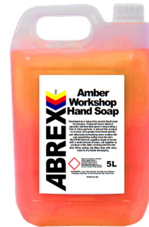
Heavy Duty Orange Workshop Liquid Soap 5 LTR (9414) Part No. CHEM0251