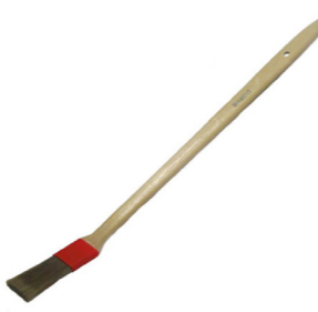
Pickling Paste Angled Brush 1" Part No. CHEM0030