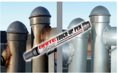
Weldaid Bright Zinc Touch Up Pen Part No. CHEM0172

The "touch-up pen" is 69% zinc metal in an easy-to-use container. One step color matches the shiny look of Hot dip galvanizing. Special no clog nozzle. Meets ASTM-A780 for corrosion protection.