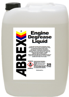
Engine Degreaser Water Soluble 25 LTR (6288) Part No. CHEM0247 5 LTR - CHEM0246