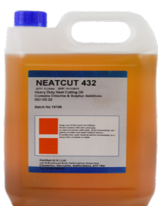
Neat Cutting Oil 5 Litre Part No. CHEM0266