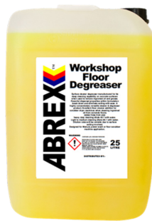
Workshop Floor Cleaner Degreaser 25 LTR (7225) Part No. CHEM0263 5 LTR - CHEM0262