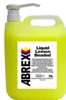
Citrus Lemon Beaded Hand Cleaner incl Pump 5 LTR (9377) Part No. CHEM0249