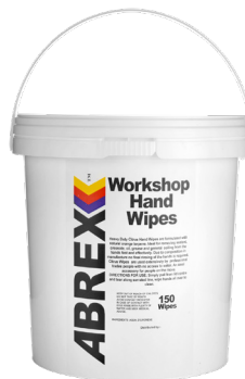
Workshop Citrus Hand Wipes 150 Sheet (8812) Part No. CHEM0252