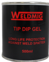
Tip Dip Gel 500ml Part No. CHEM0170