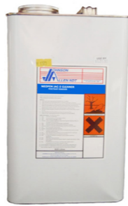
J.A.C- 3 Ultra Cleaner 5 Litre Part No. CHEM0102