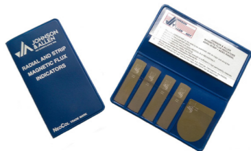
Type 1 Flux Indicator Strips (Wallet of 5) Part No. CHEM0203