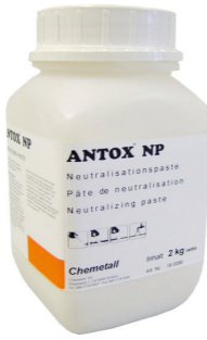
ANTOX NP Neutralising Paste - 2 Kg