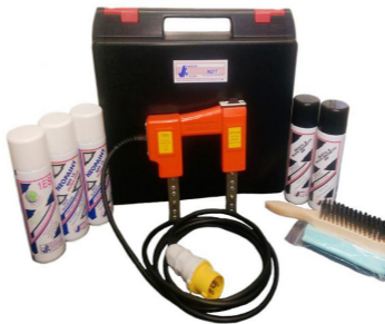
JAYSON MPI Kit Part No. CHEM0213