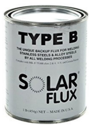
Solar B Flux Part No. CHEM0175

Solar B Flux is a complex chemical compound in the form of a very fine powder mixed with alcohol (methanol/methyl alcohol preferred) and brushed on the back of the weld joint. It is formulated to shield the Back of the weld joint from oxygen, dissipate heat and unwanted oxides, and to clean the surface of the metal. It will aid in the flow of filler metal over base metal and form a protective barrier to prevent re-oxidation and heat scale.