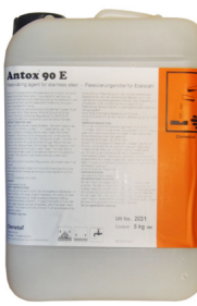
ANTOX 90E Liquid - 5 Kg