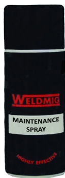
Maintenance Spray 300ml Part No. CHEM0190