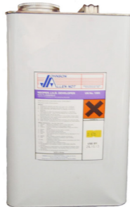
J.A.D Developer 5 Litre Part No. CHEM0101