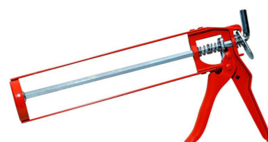
Silicon Gun 400ml

White Acrylic Caulk Decorators Sealant 300ml Part No. CHEM0235