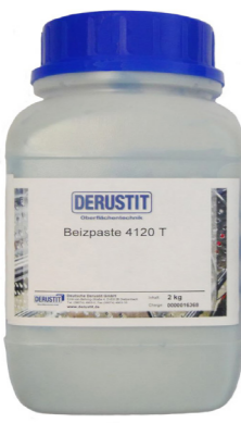
Pickling Paste - 4120 Turbo 2 Kg Part No. CHEM0020