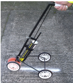
Line Marking Trolley Part No. CHEM0078