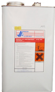
J.A.P W/W Penetrant 5 Litre Part No. CHEM0100